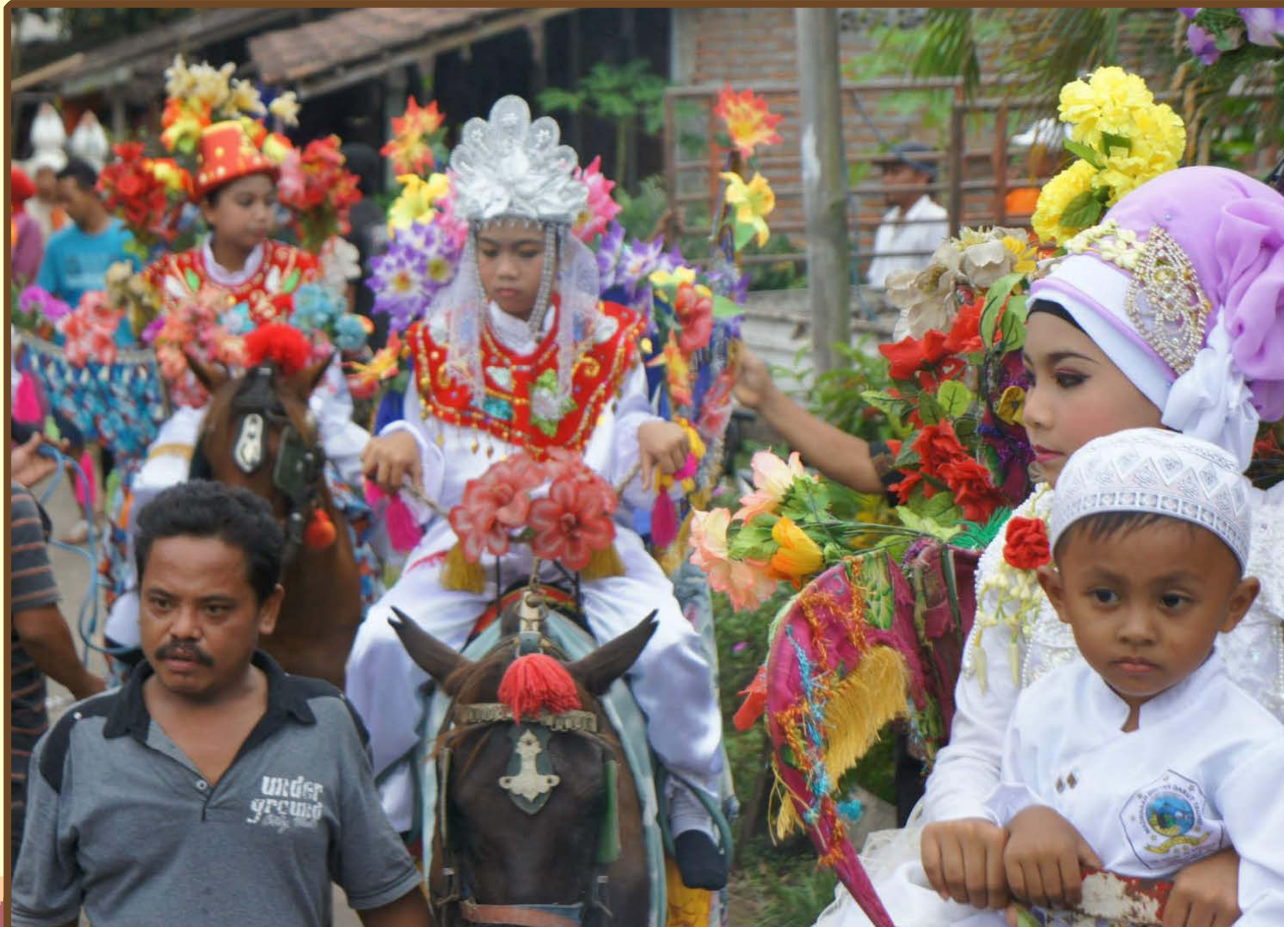
in East Ungaran, Central Java, Indonesia

On this day parents often tell stories about the Prophet Muhammad's life to their children. In some countries Muslims hold street parades to celebrate his birthday and decorate buildings with lights.