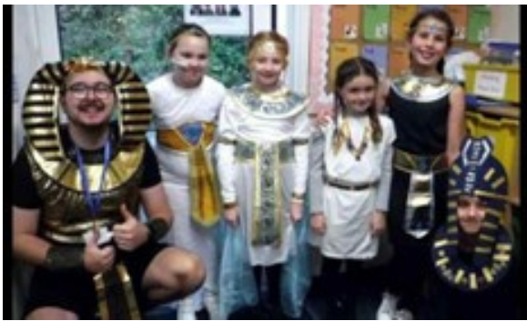
Chilton 'Walks Like an Egyptian'

This term has been extremely busy for children as our staff look to ensure learning is as engaging as it is purposeful. The Viking team are constantly looking for ways to bring learning to life, opening our classroom doors to visitors in various guises to add the extra sprinkle of magic to create the awe and wonder we want for our children. Below are just a few photos showing the creative way children across Viking immerse themselves in their learning.