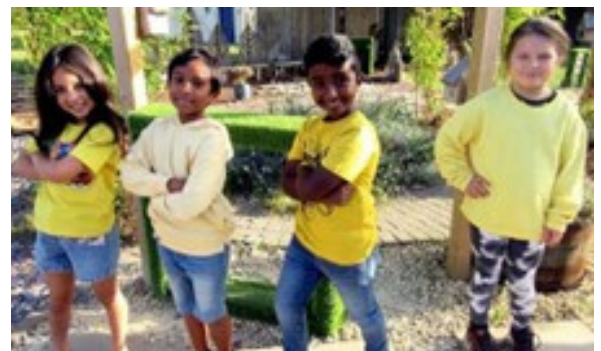
'Hello Yellow' at Upton

Don't forget you can keep in touch with all Viking news and events by following each school on Instagram, Facebook and X (Twitter).